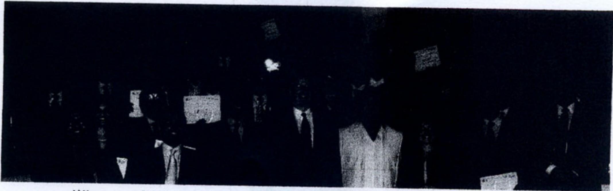
Winners of Pakistan 25 recognized by Minister for Finance, Revenue, Economic Affairs and Statistics and the US Ambassador to Pakistan

After the successful launch in January of Pakistan 25, which broke AllWorld record of highest growth of 8 countries in the Middle East, South Asia and Africa, AllWorld Network and Professor Michael Porter of the Harvard Business School , are launching the first ever Pakistan 100, a ranking of the most dynamic and fast growing private companies. Hear from Pakistan 25 Winners.